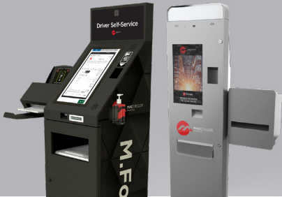
Indoor & Outdoor units available.